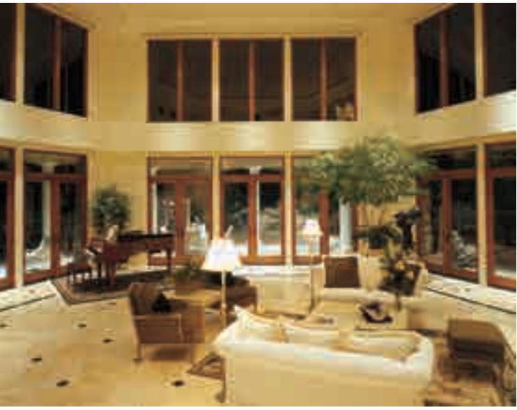
When you're on the inside looking out, the 3M Night Vision window film's low reflectivity allows ultra-clear views—even at night.

According to Kehl, Night Vision window film made sense for several reasons.